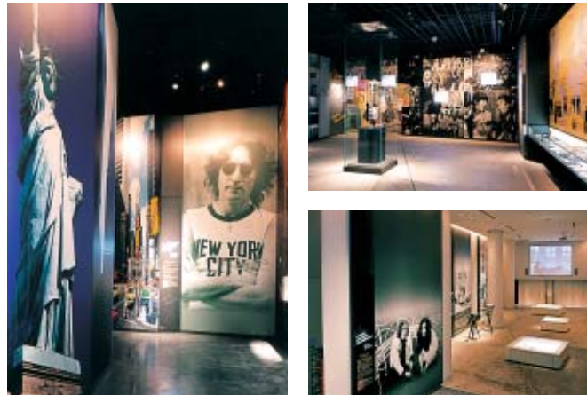
The exhibition space is divided into nine time zones, recreating through personal memorabilia and displays places where John lived or performed. Each zone is accompanied by background music symbolic of each period of John's life.

John Lennon was a well-loved artist whose life and work continues to influence people around the world today. This museum was set up to pass on his 40-year life story and message to future generations. With formal approval from John's wife, Yoko Ono, Taisei became the principal organizer for the first permanent museum dedicated to the artist in Japan, inside the Saitama Super Arena in the Saitama New Urban Center. The museum portrays John's life with approximately 130 exhibits, including photographs and many personal items made available to the public for the first time, depicting his boyhood days in Liverpool, UK, through the forming of The Beatles, to his solo performances following the breakup of the band. The museum has welcomed many visitors since opening on October 9, 2000, the sixtieth anniversary of John's birth.