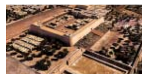
The City of Ur of the Mesopotamian Civilization, top; and the City of Dholavira of the Indus Civilization, below. Buildings have been realistically reproduced, including the original color tones and texture of their walls.